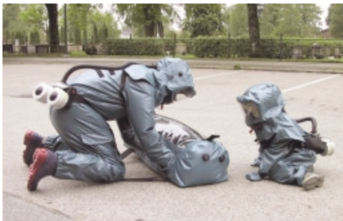
Aireshehta Limited: 0552502

However, without restoring the centrality of knowing, judging, engaging and acting, real resilience will remain a distant dream. This is not an abstract, philosophical imperative — it is the role and respon-